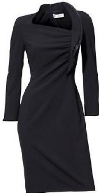
Singh Madan – Detail neckline dress £99