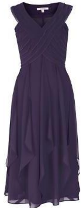
Jacques Vert – Chiffon dress £169