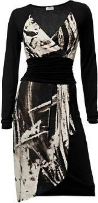
Patrizia Dini - Wrap Over Dress £69

Curvilinear body shapes are made up of mainly curved lines (think voluptuous). Balancing body proportions is very important with this body shape so that symmetry in the top and bottom half is achieved, drawing in the mid section helps to achieve this balance. Support underwear is very important to create smooth lines. This shape prefers larger prints and patterns.