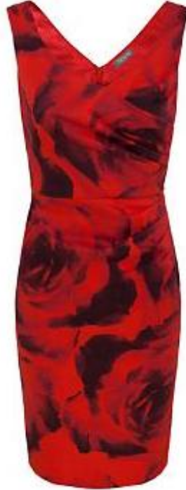
Alexon - Rose dress £125