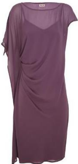
Lazy Lu - Sheath Dress £65

Angular body shapes are made up of mainly straight lines (think elongated). This is one of the easiest shapes to dress as almost anything can be worn and the use of layers is endless. The only thing to consider is making your lines appear softer and with the ability to add curves. This shape prefers smaller details, unless making a statement.