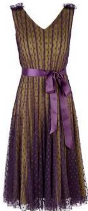
Jacques Vert - Spot Dress £179