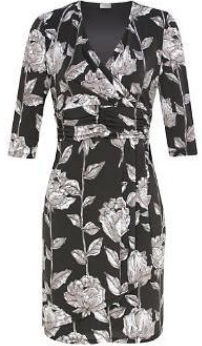
Minute Petite - Rose print £89