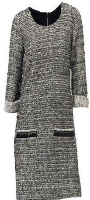
Heine - Tweed look £59