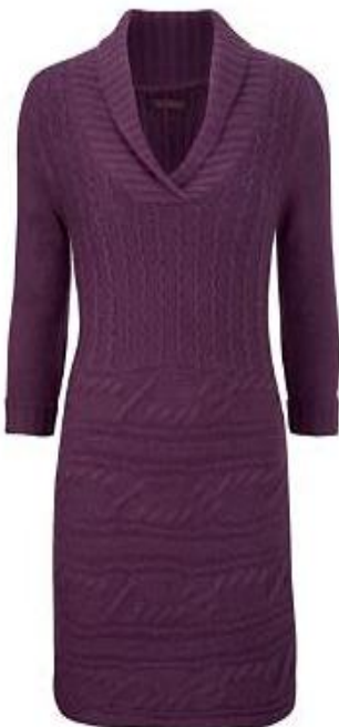
Joe Browns – versatile knit dress £30

The Interjacent body shape (think hourglass) is made up of both straight and curved lines and is the body shape of the majority of women. Creating symmetry and fluidity is key, again if you are concerned about your mid area, support underwear will help create a smoother silhouette; Spanx do one of the best ranges I have seen.